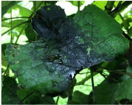
Figure 4. Honeydew and sooty mold.

Damage from the spotted lanternfly comes primarily from repeated feeding especially on grapes, hops, and plants in orchards, nurseries and the hardwood industry. Feeding on plant juices results in excretion of a sweet, sticky substance known as honeydew and accumulation of dripping honeydew from heavily infested areas can result in the growth of sooty mold on surfaces (Figure 4). In 2017, heavy feeding was seen on walnut, red oak, maple and hickory trees which resulted in flagging and dieback.