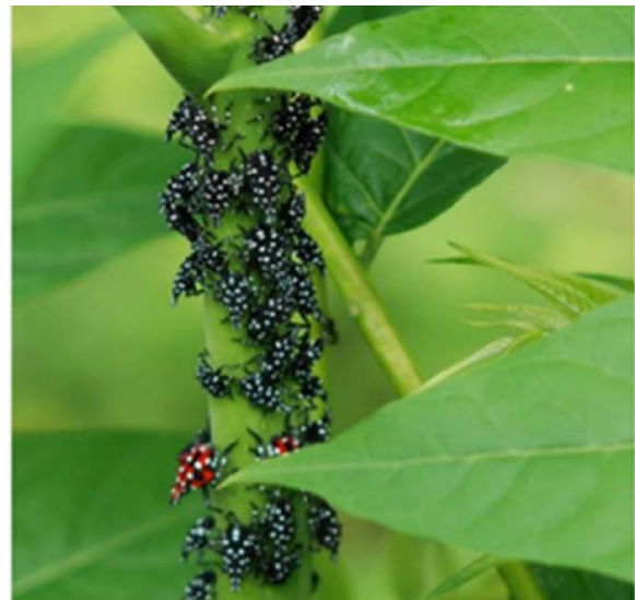
Figure 3. Immature spotted lanternflies.

traveling. This involves wrapping the trees with a band of sticky paper, which catches the insects as they crawl.