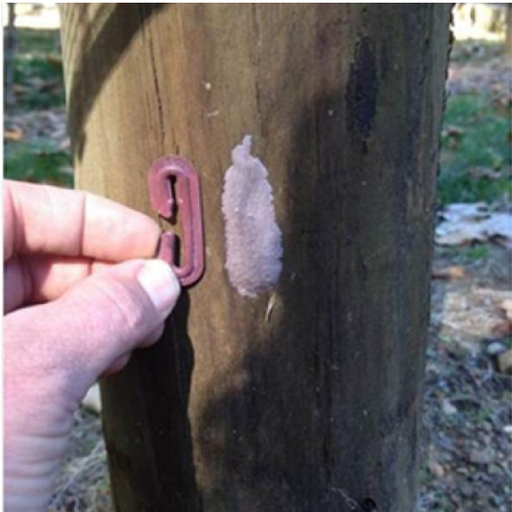
Figure 2. Spotted lanternfly egg mass.

In Pennsylvania spotted lanternfly completes one generation per year. It begins laying eggs in the fall of the year in clumps of 30–50 eggs which are covered in a foam-covered mass (Figure 2). Egg masses are laid on trees and many other smooth surfaces and are often hidden. Many eggs are laid on surfaces like cinder blocks, rocks, rusty barrels, picnic tables, and other outdoor items. As eggs masses age they begin to look more like dried clay or mud. Egg masses can be removed by scraping the mass off a surface they are attached to and placing them in rubbing alcohol or hand sanitizer.