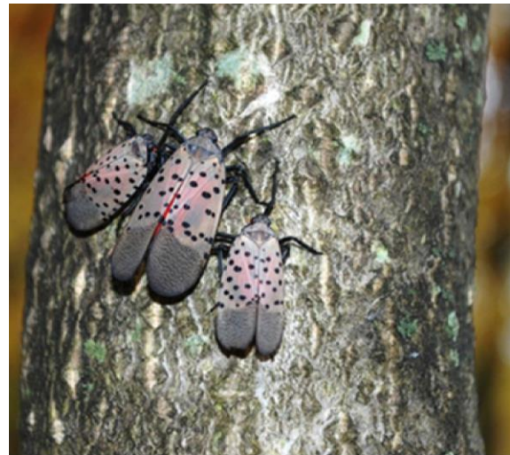
Figure 1. Adult spotted lanternfly, Lycorma delicatula

types of plants. In Pennsylvania the spotted lanternfly has been recorded feeding on many different plants including Ailanthus , Salix , Vitis , Acer , Prunus , Quercus , and Juglans , along with a range of vines, ornamentals, and garden plants. Adult Lycorma narrow their host range to A. altissima , or tree-of-heaven, before mating and laying eggs.